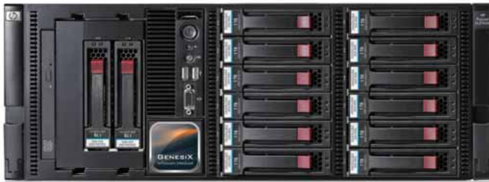
The full Genesis VideoServer provides everything needed to simply and flexibly operate a failsafe television station – from ingest and planning to playout, building on proven playout features

It builds on proven playout features (playout automation,